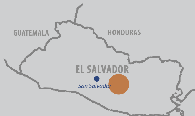
● Approximate area of impact

ENLACE has been working in the region since 2008 with Pastor Santos Carpio and The Tabernaculo Biblico church in El Espino. The region includes seven churches with two more churches on a waiting list. In 2014, these churches hope to implement more than 15 projects that will directly impact the lives of more than 3,000 people.