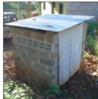
Three churches in the region have already installed more than 300 latrines.