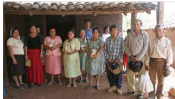
Part of the Abelines Health Committee