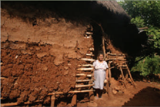
a house in abelines even further damaged by the rains