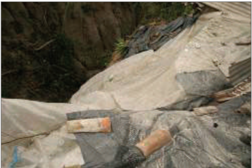
mudslide in las delicias

In the communities of Las Delicias, El Tinteral and San Jose El Naranjo the churches and communities are hard at work repairing houses, roads, bridges water systems and even damaged agricultural areas. In addition, risk mitigation projects have been identified in El Tinteral and Las Delicias where church and community members will be constructing more retaining walls and terracing in strategic areas to prevent damage during future storms.