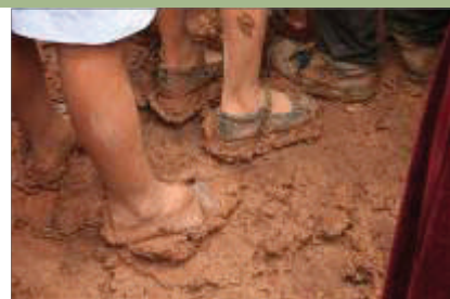
waiting in the mud