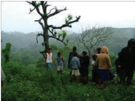
el tinteral community members

In the community of Abelines, the health committee is responding to an increase in infant and elderly illnesses and some houses dangerously close to collapsing due to the persistent weather.