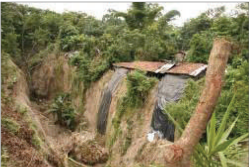
house in danger in las delicias

Now that the storms have mostly passed and the sun is shining again, ENLACE is committed to collaborating with partner churches as they develop long-term solutions long after