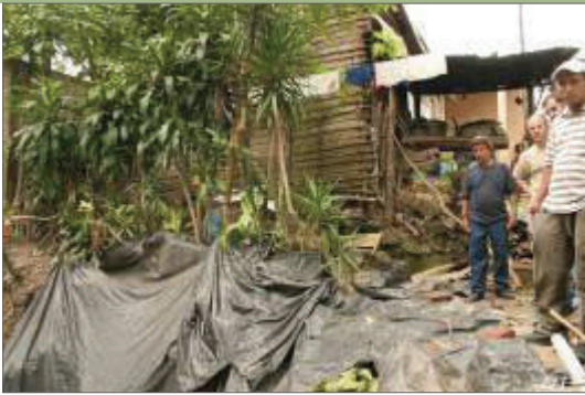
church leaders near landslide in las delicias

Now that the storms have mostly passed and the sun is shining again, ENLACE is committed to collaborating with partner churches as they develop long-term solutions long after