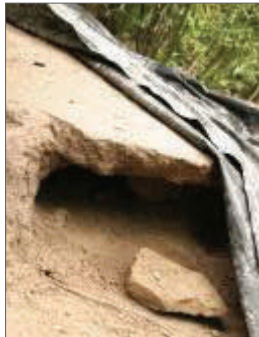
washout under house foundation